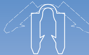
SubQ It! Flexible fastener