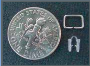
SubQ It! Fastener and standard surgical staple comparison

The only bioabsorbable subcuticular skin closure device for short and minimally invasive incisions