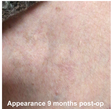
Appearance 9 months post-op